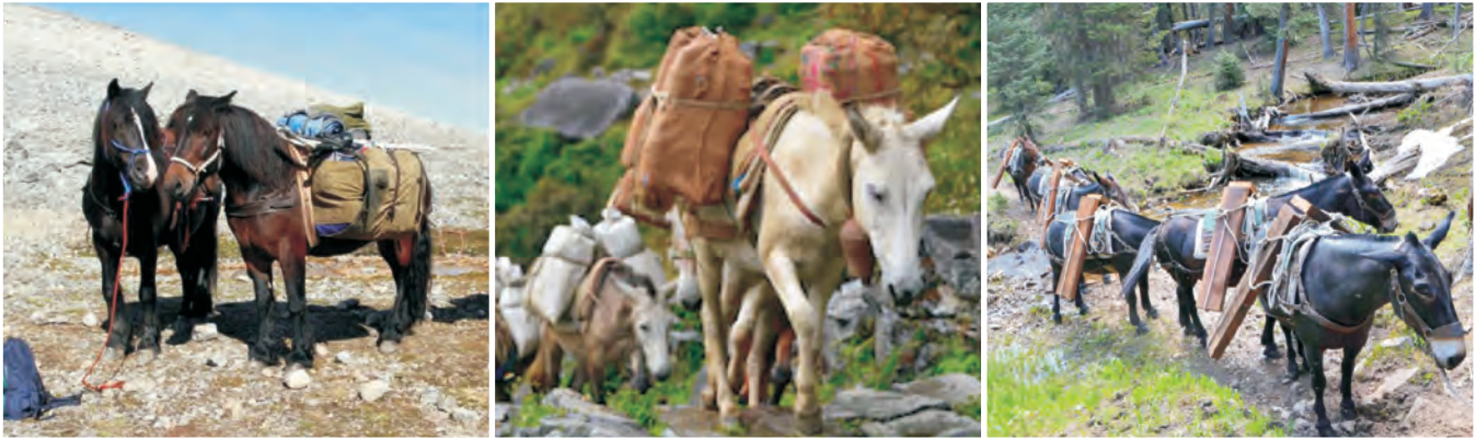
Beasts of Burden : These animals are used to carry load.