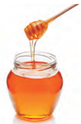
Food from animals